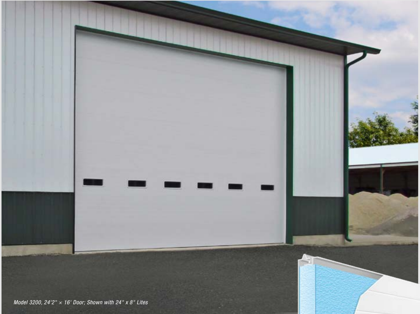
Model 3200, 24'2" x 16' Door; Shown with 24" x 8" Lites