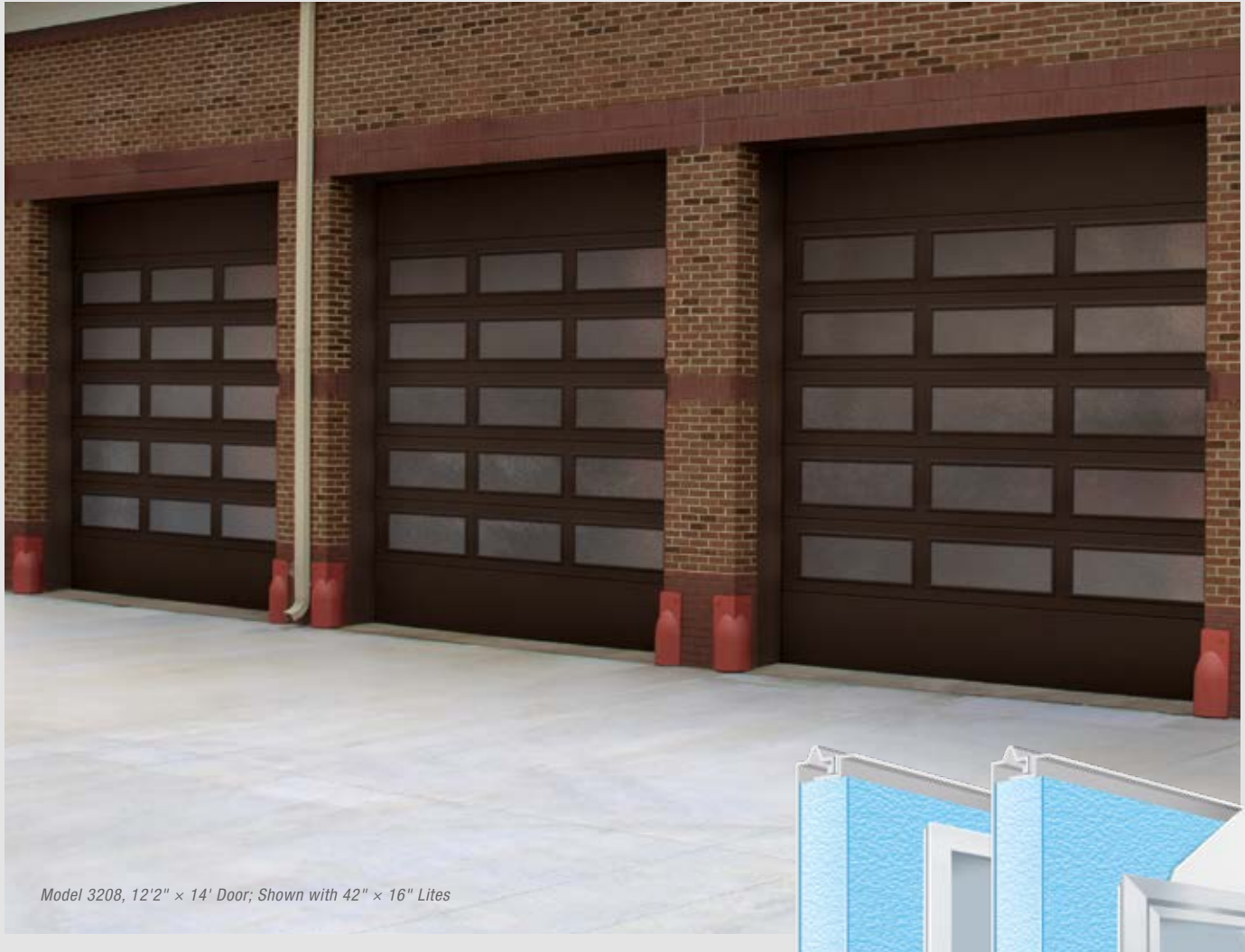
Model 3208, 12'2" x 14' Door; Shown with 42" x 16" Lites