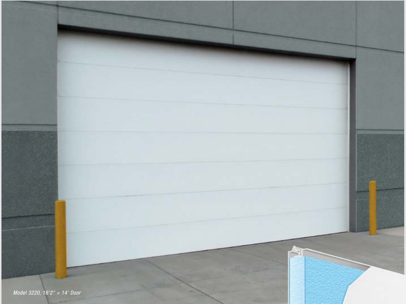
Model 3220, 16'2" x 14' Door