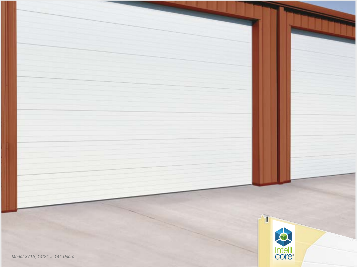
Model 3715, 14'2" x 14" Doors