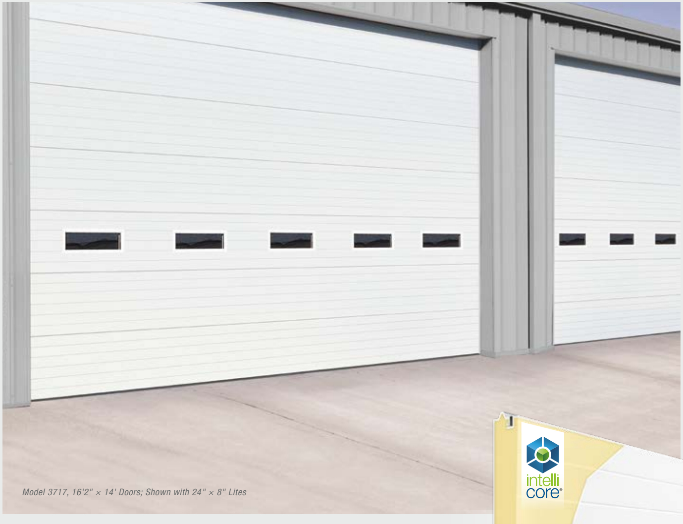
Model 3717, 16'2" x 14' Doors; Shown with 24" x 8" Lites