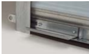
SLIDE BOLT LOCK