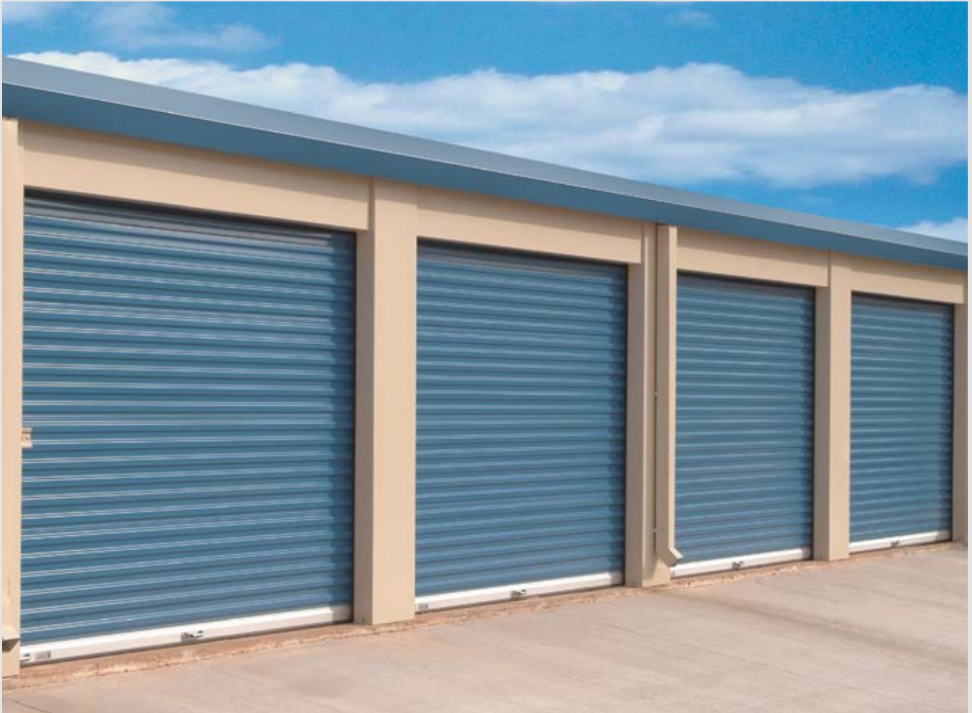
Model 157C, Roll-Up Sheet Door