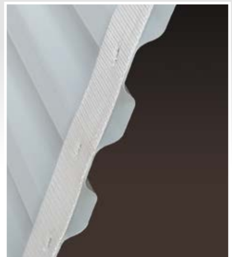
Corrugated Panel Design (Model 157C Shown)