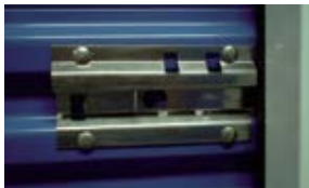
LOCK MINI LATCH

Maximum Height – 14' (150C, 155C, 156C, 157C), 18' (160C).