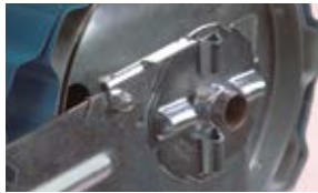
RATCHET SPRING TENSION ASSEMBLY