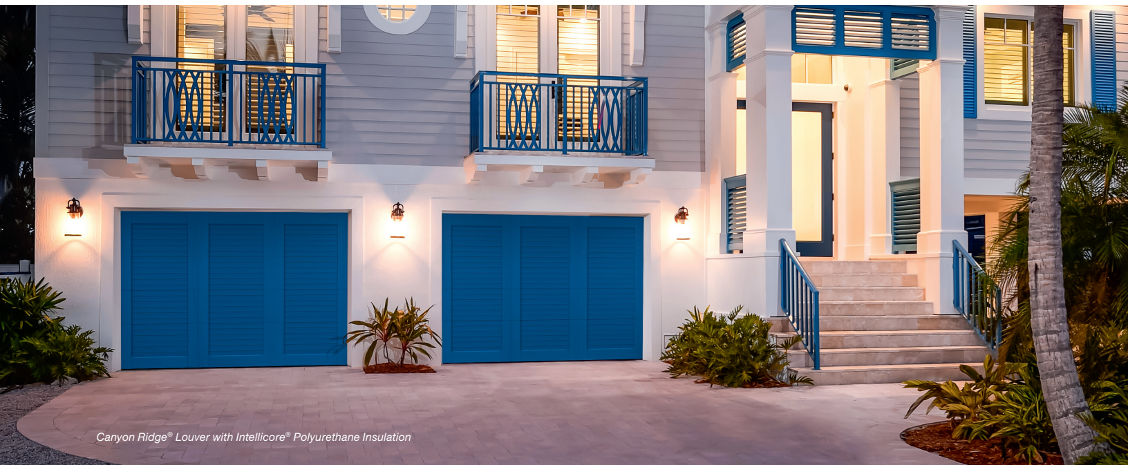
Canyon Ridge® Louver with Intellicore® Polyurethane Insulation